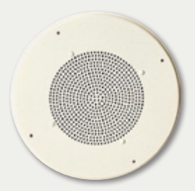
SP-2570N Ceiling Speaker