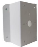
HIA-B201 Corner Mounting Bracket