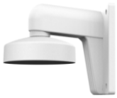
HIA-B401-110T Wall Mounting Bracket