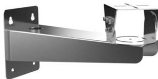
DS-1701ZJ Wall Mounting Bracket