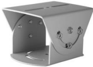
DS-1232ZJ Cardan joint