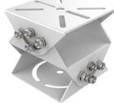
DS-1232ZJ-T Cardan joint